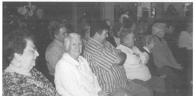
A large crowd enjoyed the celebrations at the Clandeboye Hall.