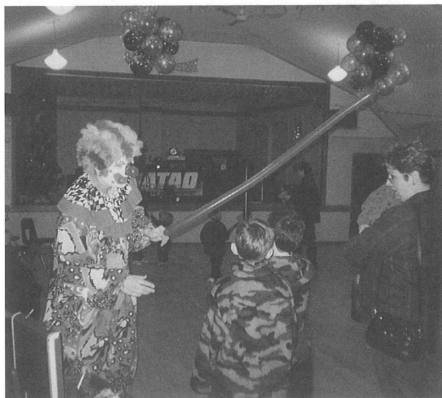
The Jesturs entertained the children with face painting and balloons during the afternoon of January 1, 2000.