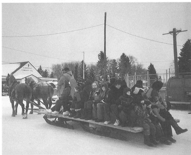
Horse drawn sleigh rides at the Clandeboye Millennium Celebrations on Saturday, January 1, 2000.