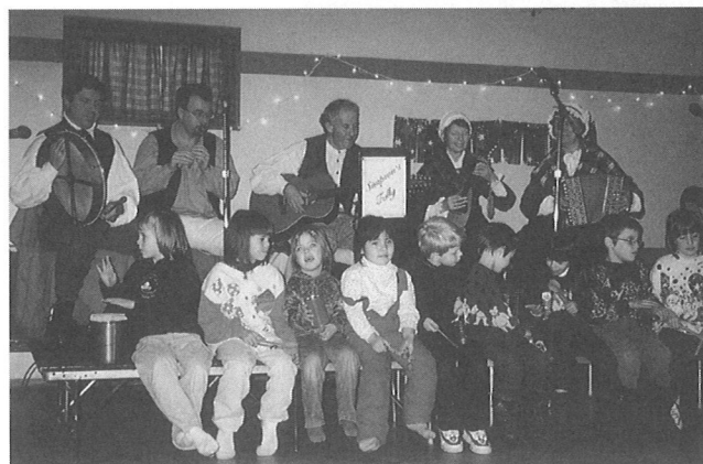
Clandeboye children play an Irish jig along with Simpson's Folly during the community's Millennium celebrations at the Clandeboye Hall, Sunday, January 2, 2000.