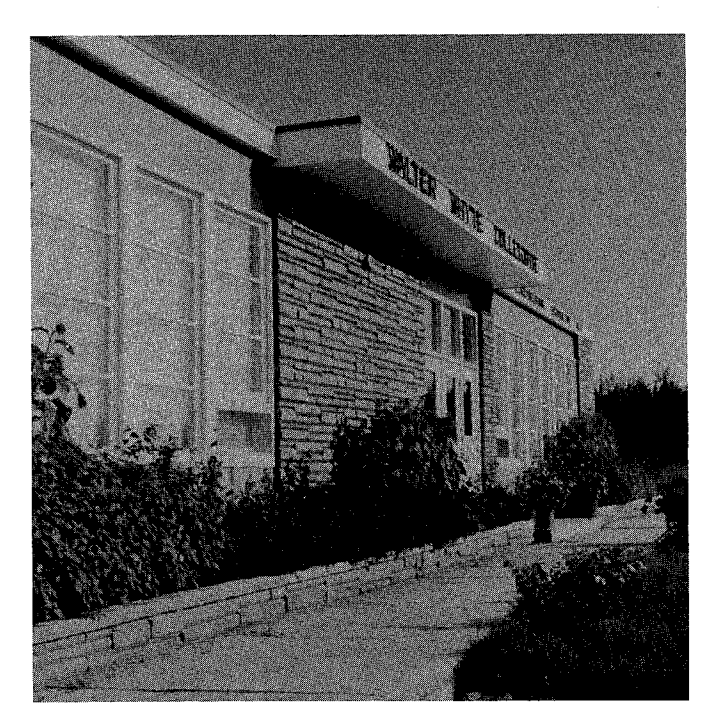
Walter Whyte Collegiate.

finally three teachers in each school. The other six schools taught Grades 1 to 8. Any student wishing to further their education could do so by enrolling in a correspondence course, but could still attend their own school.