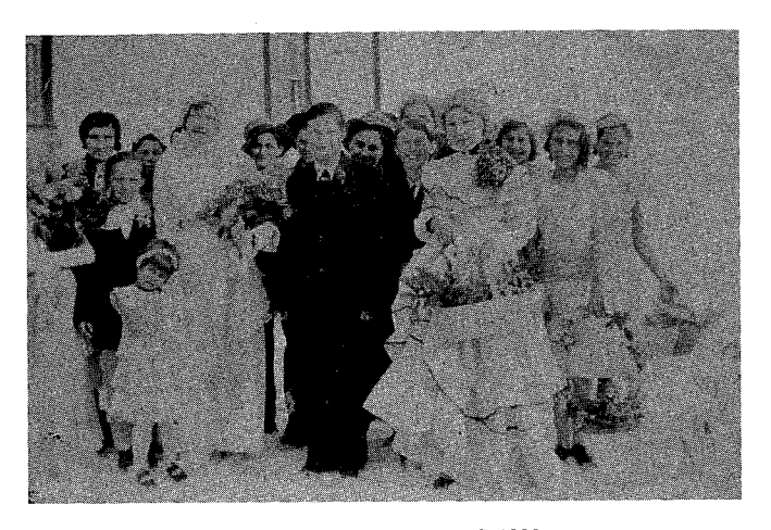
Girls from Donald School, 1933.

school. The old building is to be repaired and several alterations are to be made. Two modern outbuildings have to be put up and the grounds fenced and buildings painted."