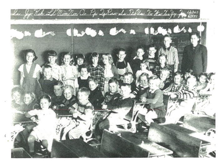
Inside Donald School.

The Donald School (River Lot 255) was destroyed by fire in Dec. 1946. It was insured by policies No. 31195 and 30970 through the Portage la Prairie Mutual Ins. Co.