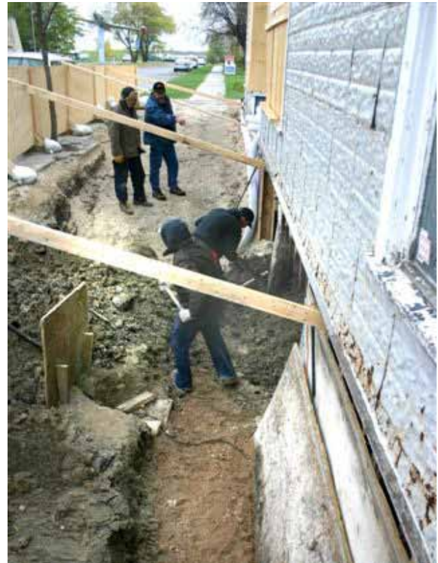
H.P. Tergesen and Sons General Merchant, Gimli, MB. Integrate improvements in energy efficiency into necessary repair work

For more do-it-yourself information, see Manitoba Hydro's Power Smart Energy Guide: Basement & Crawlspace Insulation information booklet at www.hydro.mb.ca ; or call Manitoba Hydro at 1-888-MBHYDRO (1-888-624-9376) for a copy.