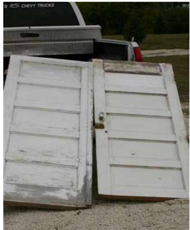
Church doors salvaged during building restoration project.

For more do-it-yourself information, see Manitoba Hydro's Power Smart Energy Guide: Wall Insulation information booklet at www.hydro.mb.ca ; or call Manitoba Hydro at 1-888-MBHYDRO (1-888-624-9376) for a copy.