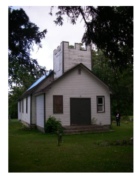
Front view of porch, 2009