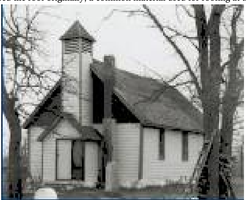
St. Jude's Church sometime before 1950

Grand Marais, a small protestant church took form in 1896. It was given the name St. Jude's (Anglican) Church.<sup>1</sup> The foundation of the church was made from local fieldstone and mortar.<sup>2</sup> Black Poplar trees, cut locally and hand sawn into square logs with dovetailed ends became the walls. The outer surface was covered with light wood panels that were painted white. The original structure was small and had a simple hall plan that was lighted along the east and west walls with rectangular, flat windows. The structure was placed in such a way as to give the front entryway a southern exposure that was initially sheltered with a small porch and a slender tower topped with a large cross. Beside the entryway was a red-brick chimney. Cedar shakes covered the roof originally, a common material used for roofing at that time.