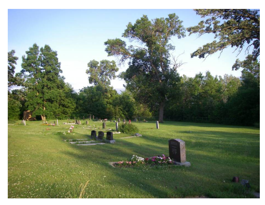
View of the cemetery, 2009