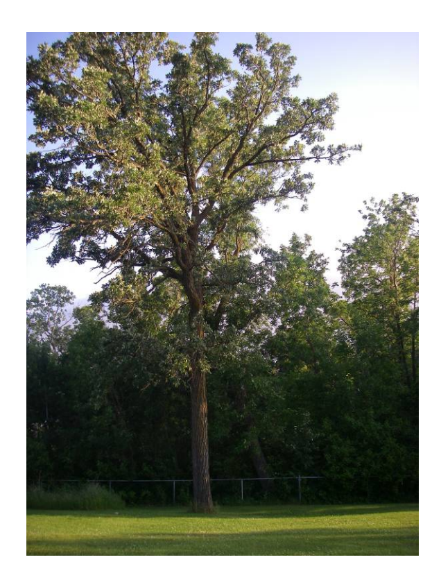
A large Oak tree in the cemetery, 2009