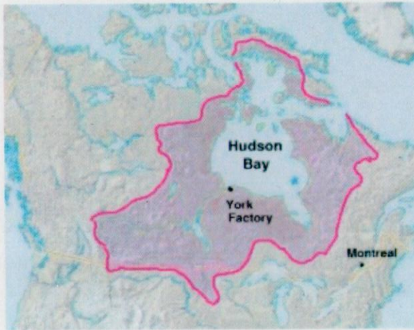
The Hudson's Bay Company Territory in 1670 (It includes all of Manitoba!)