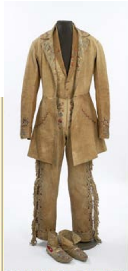
Full Métis dress (leather)