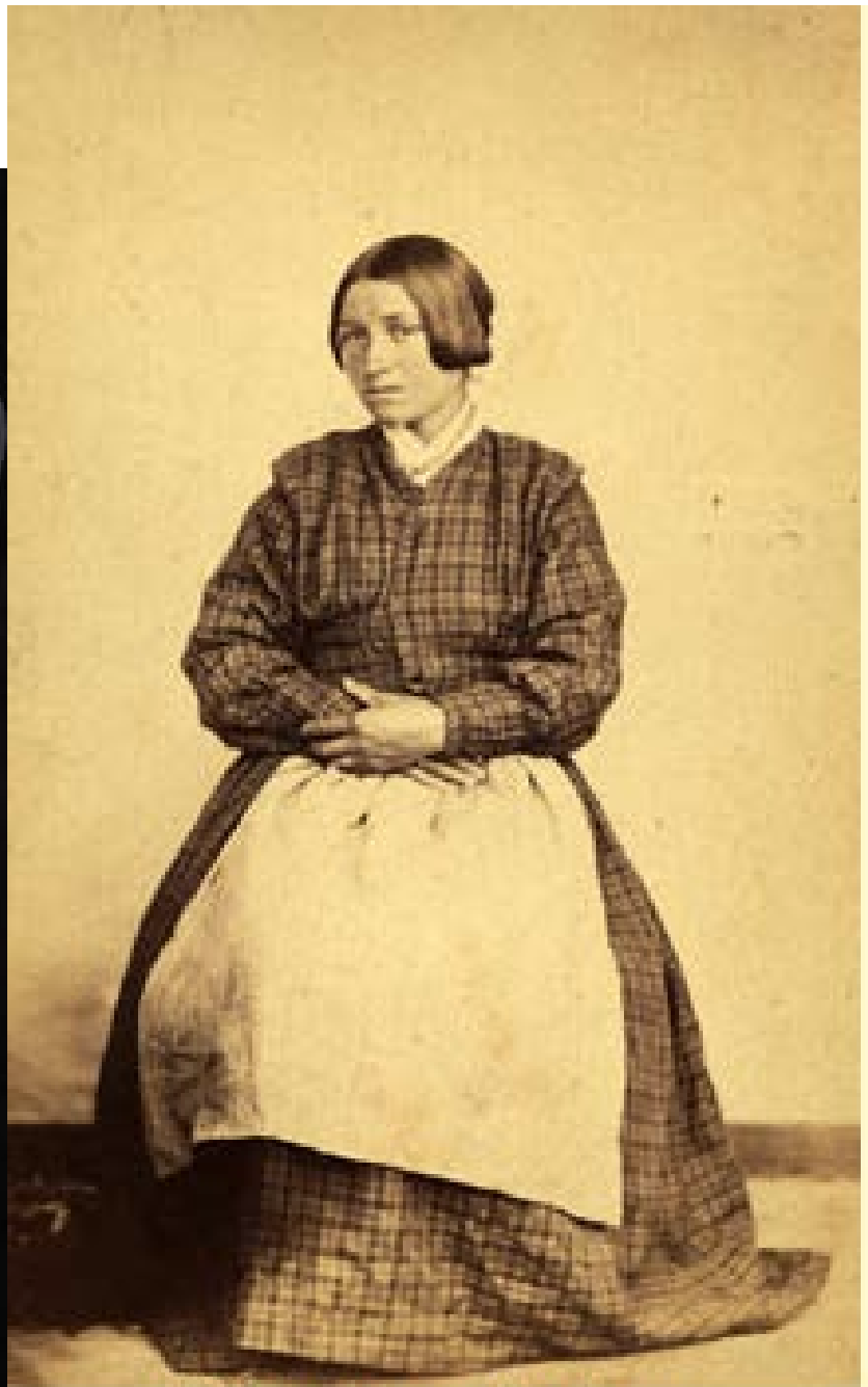
Métis woman in dress