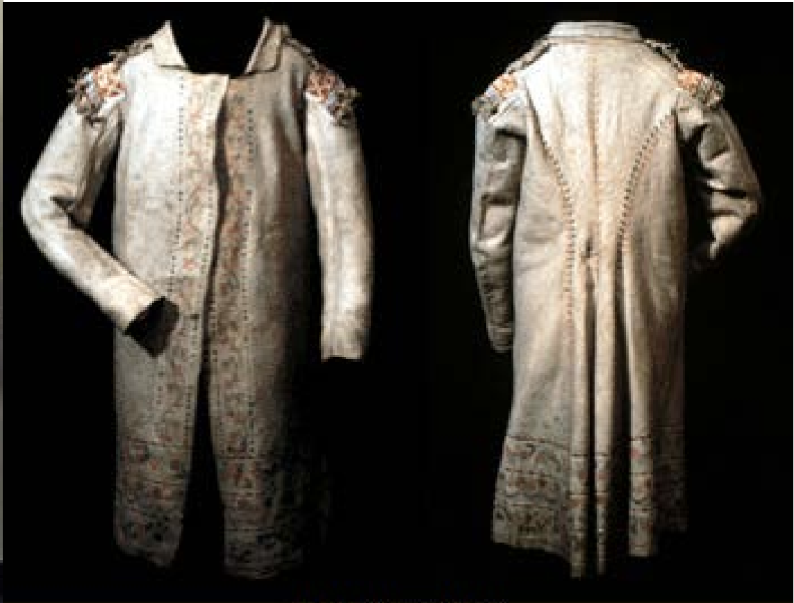
Red River Coat