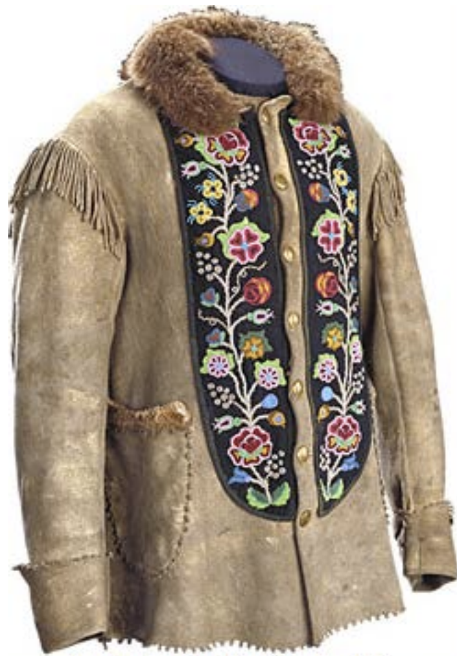
Louis Riel's Coat (buckskin)

Dress up in costumes from historical clothing. Tell a story of how you got that clothing and who you are.