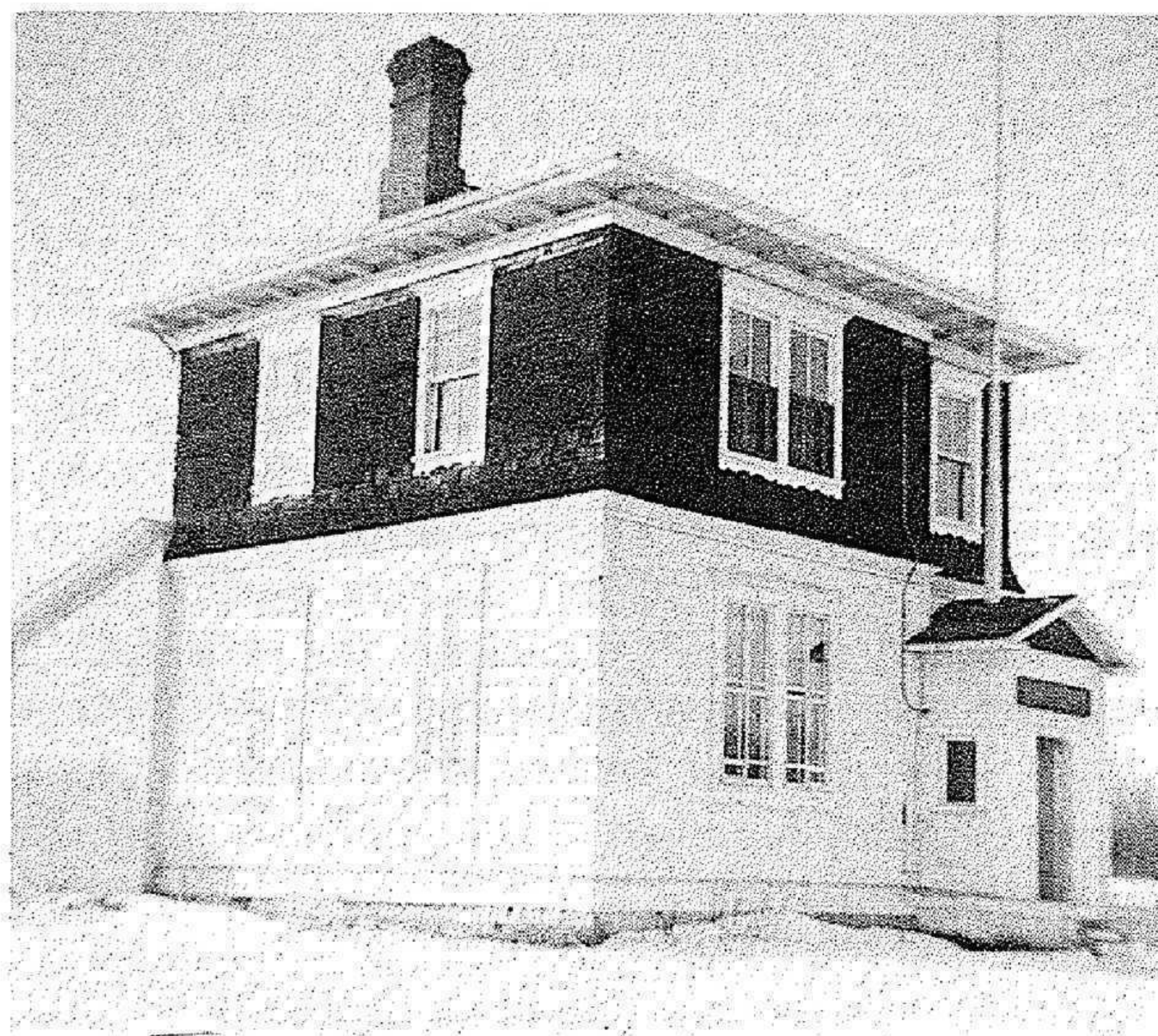
Old municipality of St. Andrews Hall.