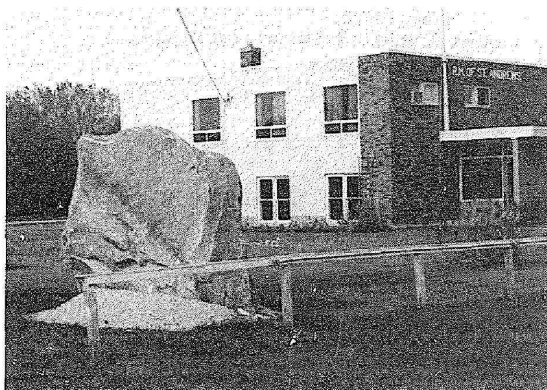
St. Andrews Municipal office, Centennial rock in foreground.

A plaque was made for the rock on the southeast corner of Municipal grounds at Clandeboye.