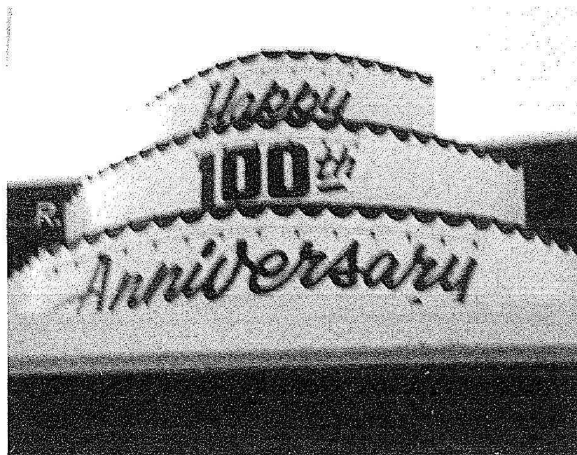
R.M. St. Andrews 100th Anniversary Cake 1881-1981.