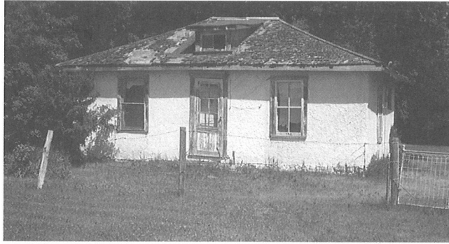
Old (Indian) Native School still standing SE 11-15-4E. Located on Cotton property, east of Clandeboye.