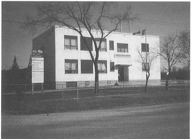
Winnipeg Beach, early and middle years school – expanding in 1999.